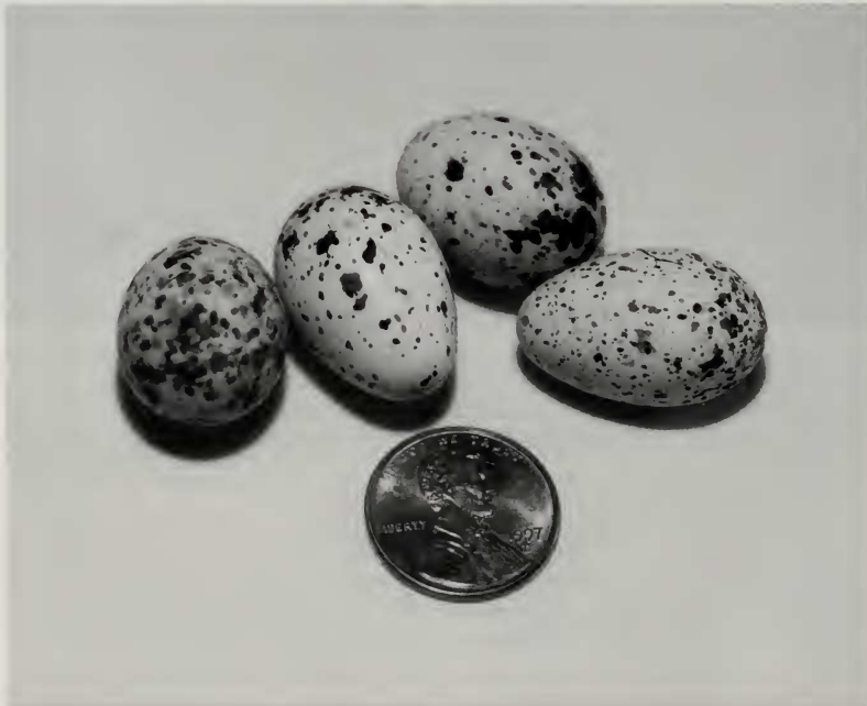
FIG. 3. Nightingale Reed-Warbler ( Acrocephalus luscinioides ) eggs, Saipan, 1998.

Nestlings. —Nestlings hatched with closed eyelids, dark gray to black skin, and totally devoid of natal down, with bright yellow gape flanges. Prior to fledging, nestlings ( n = 43 ) were almost completely feathered, except around the eyes, ears, chin, and throat (Fig. 4). Plumage was brown on all dorsal surfaces with thin buff edges around primaries, secondaries, and on the tips of the rectrices. The breast, belly, vent, thighs, and undertail coverts were light yellow to cream, with the flanks brownish yellow to buff. The maxilla was grayish black with broad yellow edges, while the lower mandible was fleshy pink with broad yellow edges. Three rictal bristles were visible on each side of the mouth above the gape flanges. The palate was reddish pink and the tongue yellow with two oblong brown